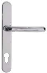
Lever / Lever