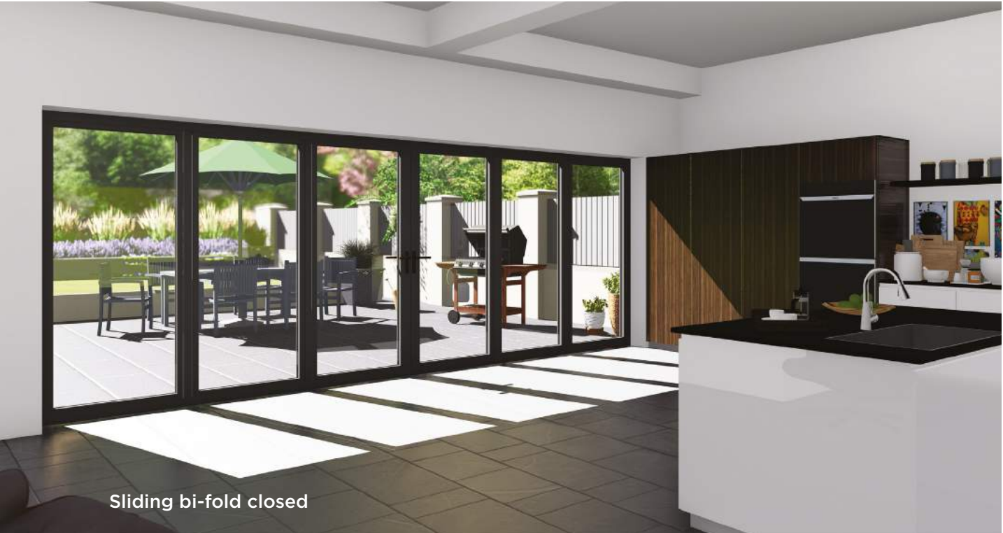
Sliding bi-fold closed

The ultimate dilemma! If you dream of open-plan living and welcoming the beauty of the outdoors into your home, do you choose on-trend bi-folding doors, or a super slim-line sliding patio door?