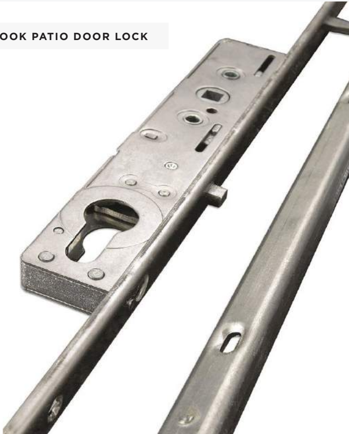
6 HOOK PATIO DOOR LOCK

Nothing is more important than keeping your home and family safe and secure. That's why all of our feature doors have enhanced security features built-in for added peace of mind.