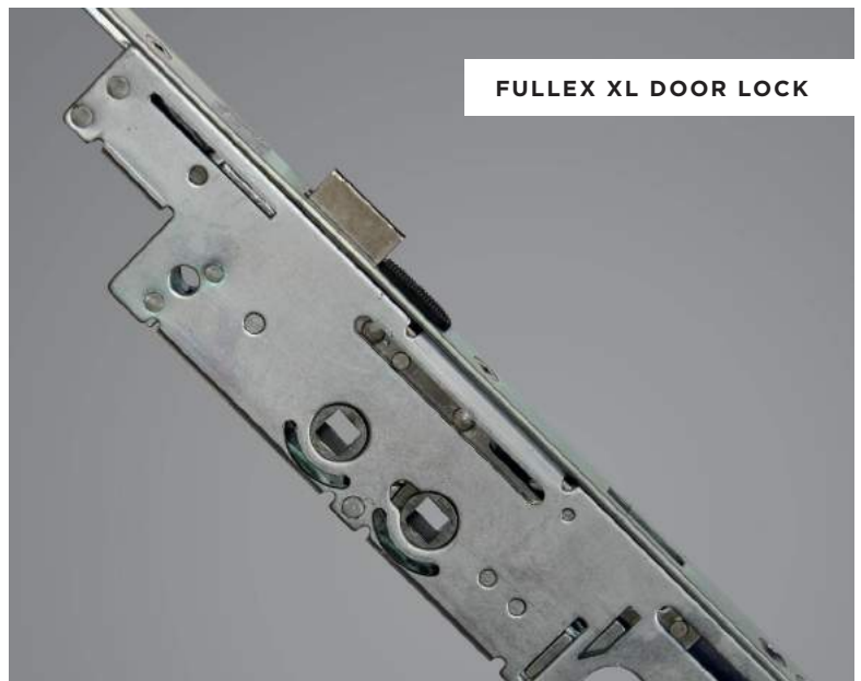
FULLEX XL DOOR LOCK

Fully enclosed components offer optimum comfort.